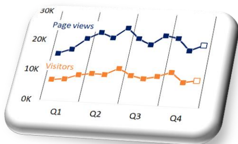
As at 13 December □ = Extrapolated to 31 December